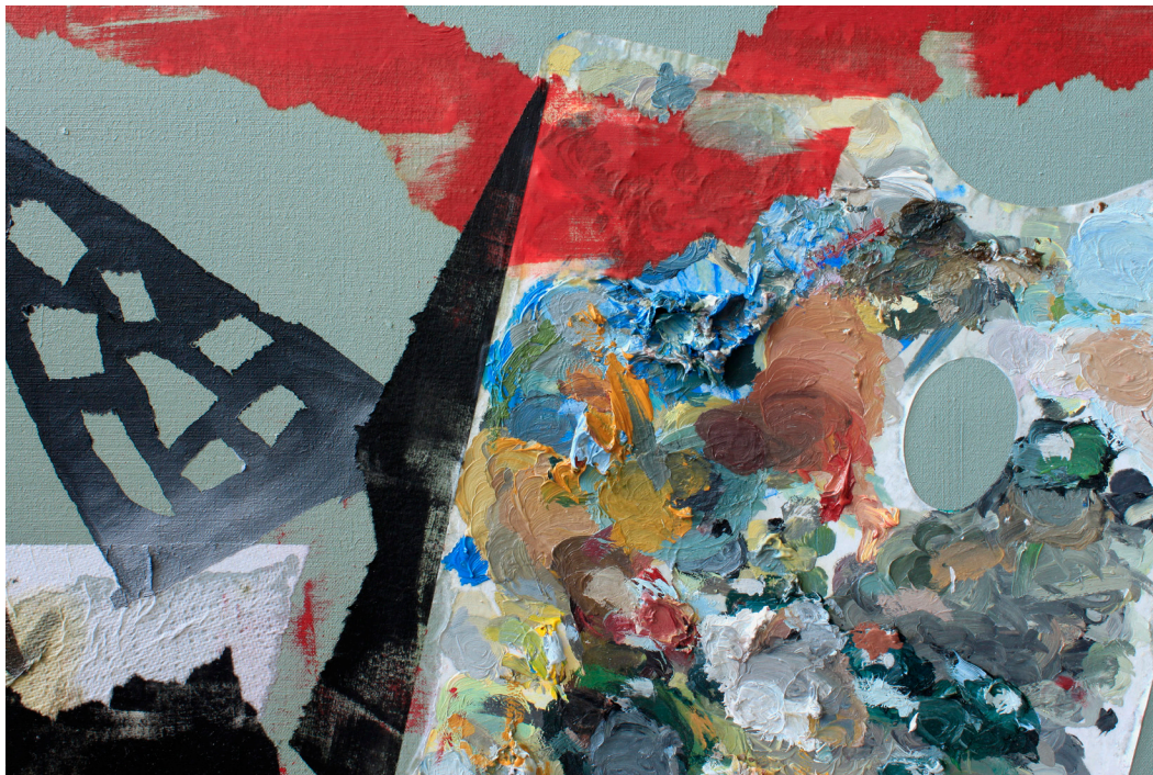
Detail image, Consilience #2

The fragmented palettes shown in the Consilience Series #1 and #2 are clumps of paint that were formed unintentionally when Chang was working on "Color in Memory." In respect to contingency, the palette pieces display greater density than other Abstract Expressionist art work. After breaking up these palettes, Chang arranged them to form a multiple point perspective so that the layers of memories coexist. By doing so, he not only expressed the transcendent concept of time within the same canvas, but also achieved synchronism in a physical form.